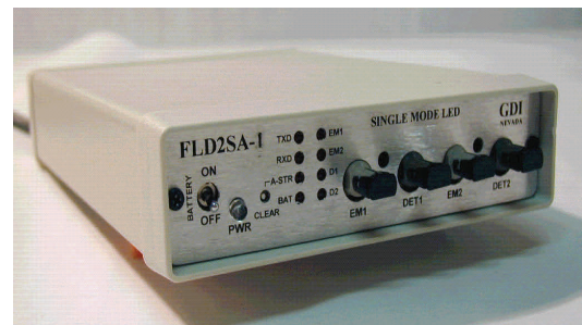
Front View of Stand Alone

Data coming upstream on Detector 2 is regenerated and sent out Emitter 1. This Data is not seen by the serial port. Local data is transmitted upstream over Emitter 1.